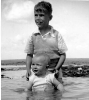
Weekends at Felixstowe