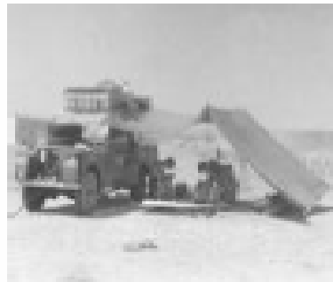
Sahara Expedition, 1964