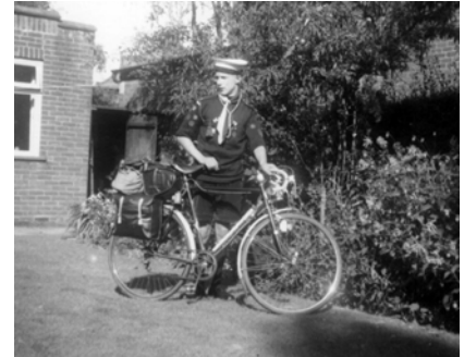
15 th Ipswich Sea Scouts