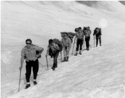
Leading a Scout trip to the Alps, 1963